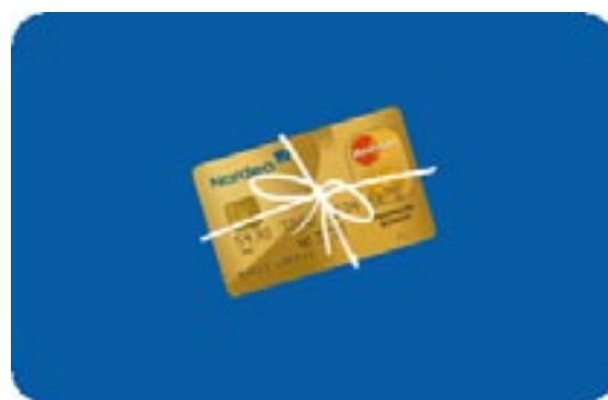
Nordea Pankki Suomi Oy